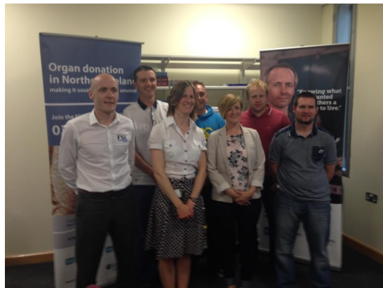
Presentation of cheque from the 'Four Peaks' challengers