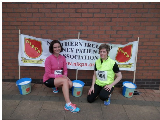
Ballymena Belles who raised money for NIKPA

Please accept our sincere apologies if we have left anyone out.