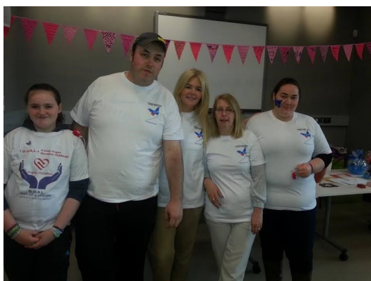
The owners of the Refresh Café who raised money for NIKPA